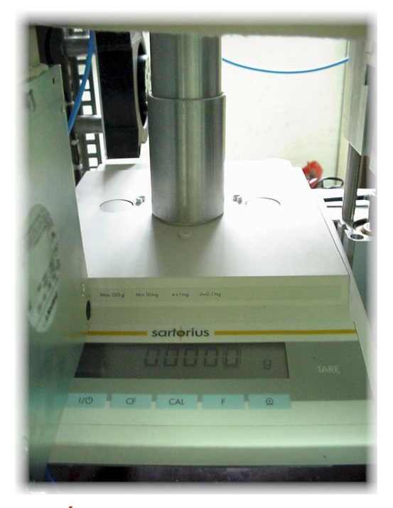
Metal parts instead of ceramics

The carousel is made of a stainless steel alloy for high temperature.